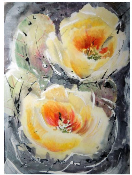
“Prickly Pear No. 342”