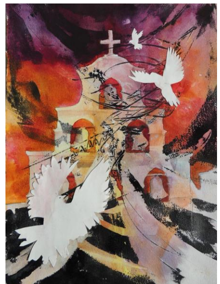
“Mission at Sunset”