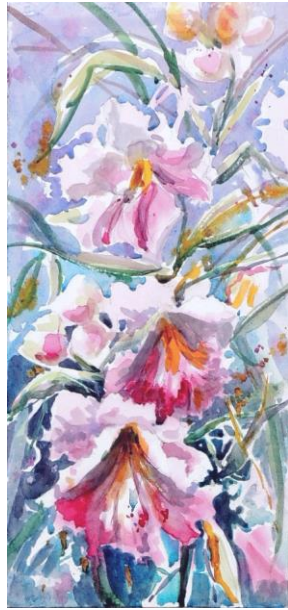
“Desert Willow Blooms”