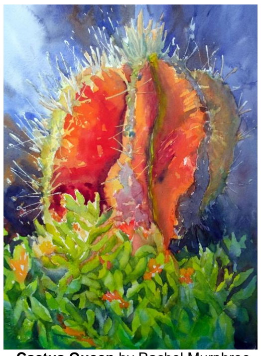
Cactus Queen by Rachel Murphree

The New Mexico Watercolor Society promotes awareness of the luminosity and lasting beauty of watercolor as a medium of creativity.