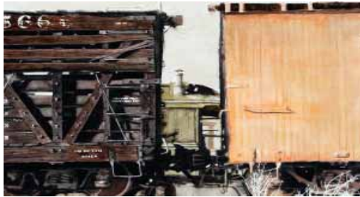
“Box Cars” Erich Fisher