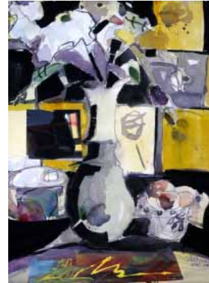
“Still Life in Yellow and Black” Marcella Boushelle