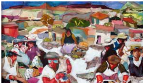
“Village Ways” Todd Tibbals