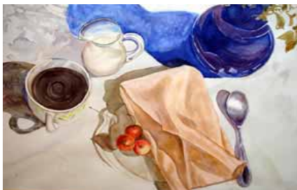
“Coffee Break” Nan Simpson