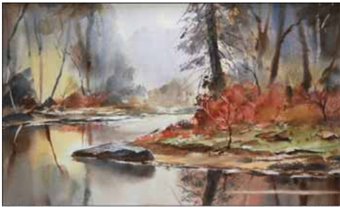
Rain in the Forest