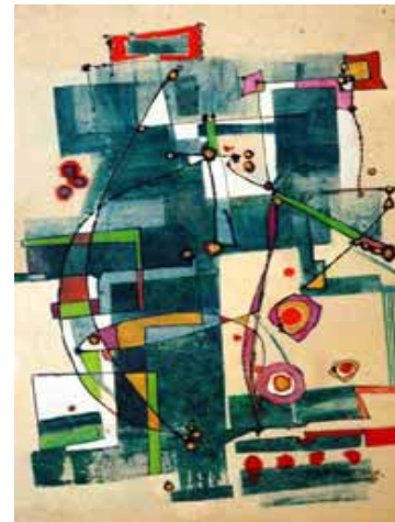
“An Inner Vision” Hazle Orr